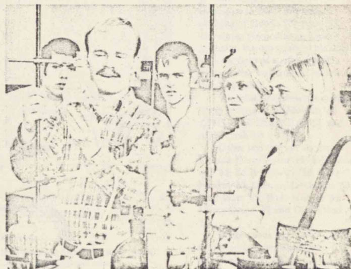
... and finally in the classroom.