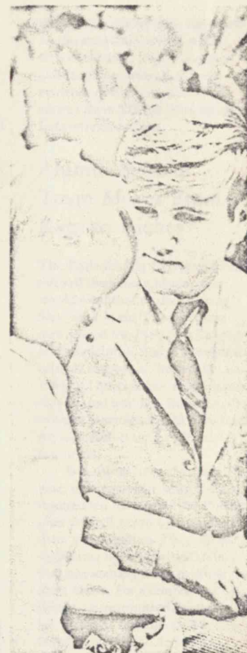
... at concerts