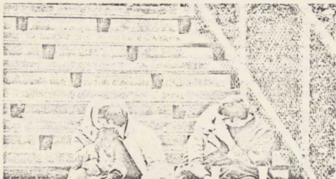
... ah ... ah ... , oh, well