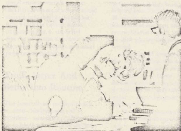
In the library